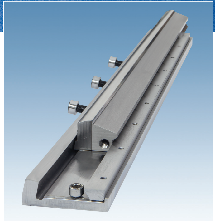
Slot applicator quick-exchange nozzle & adapter