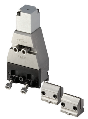
UM50 Module An economical choice for wide-web continuous and low-speed intermittent