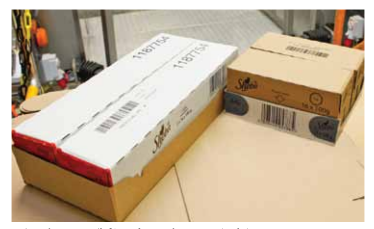
16-pack cartons (left) and 8-pack cartons (right) in transport trays

Same-size cartons are packaged side-by-side in a transport tray for shipping and delivery.