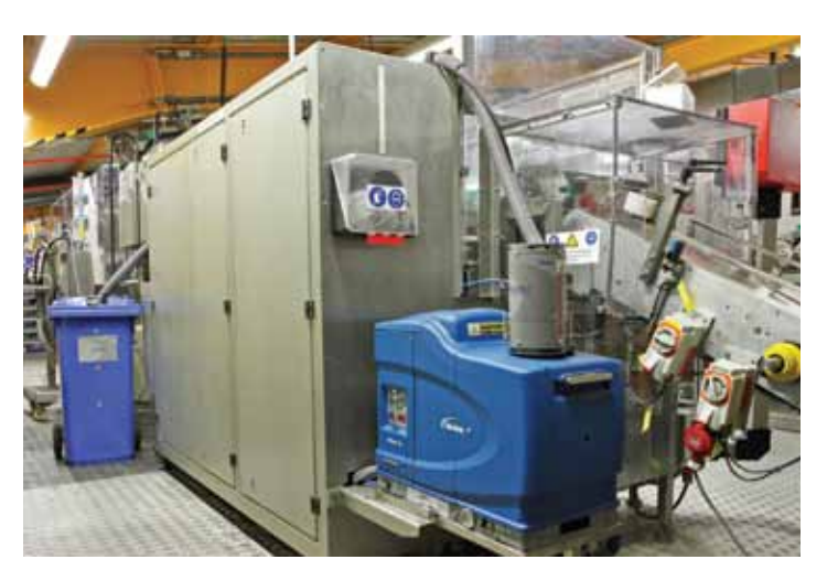
ProBlue Fulfill system with adhesive bin transfer hoses and melter on case packer.

Using the ProBlue Fulfill systems, the Verden plant eliminated low and empty melter tanks that impact adhesive integrity, cause adhesive stringing and hot melt cracking, and result in poor tray bonding.