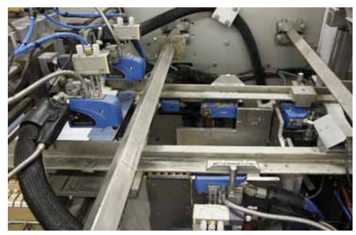
Six MiniBlue II applicators in gluing station

Mars chose to install Nordson MiniBlue II long-life applicators. The compact, 16-mm wide applicators fit easily into the existing Paal packaging machinery and delivered immediate benefits.