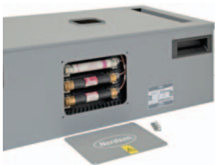
Removable panel makes fuses easily accessible from front of melter