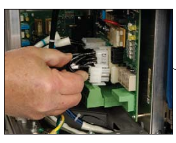
Easy plug-in connections allow additional channels to operate through melter controls